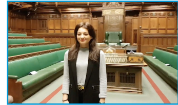
House of Commons: