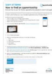
FAA account set up