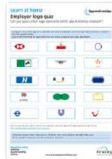
Employer logo quiz