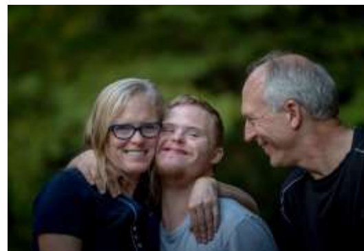
Friends and family