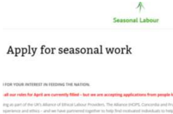
Sector jobs websites