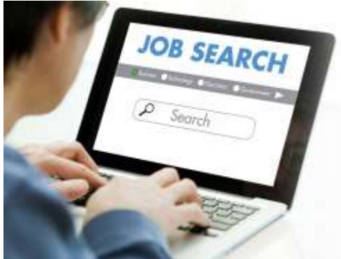
General jobs websites