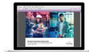
Sixth Form Guide