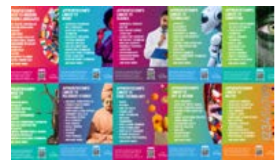
Subject posters <a href="https://amazingapprenticeships.com/resource/school-subject-posters/">https://amazingapprenticeships.com/resource/school-subject-posters/</a>

Find all our posters here: <a href="https://amazingapprenticeships.com/resources/?posters=1">https://amazingapprenticeships.com/resources/?posters=1</a>