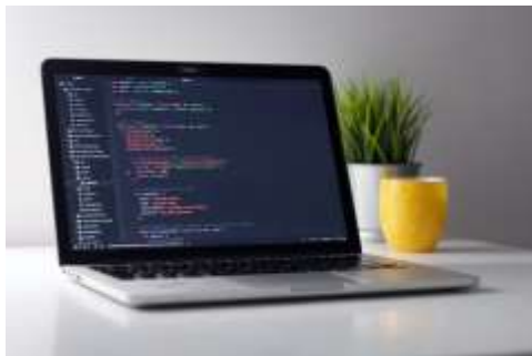
Learn basic coding