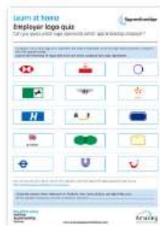
Employer logo quiz