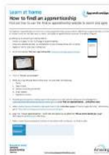
FAA account set up