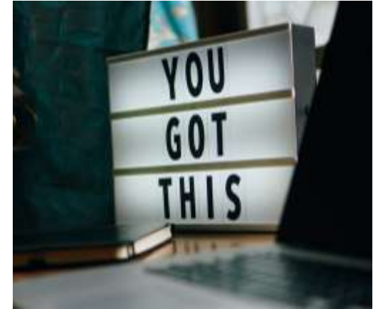
Determination & resilience