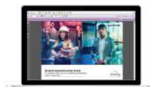
Sixth Form Guide