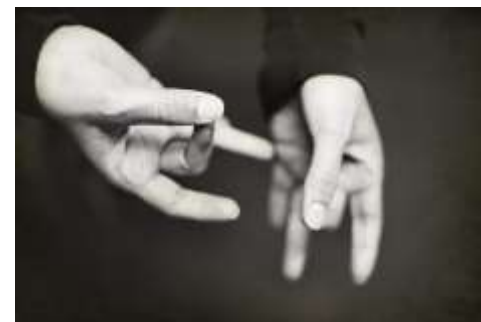
Learn basic sign language