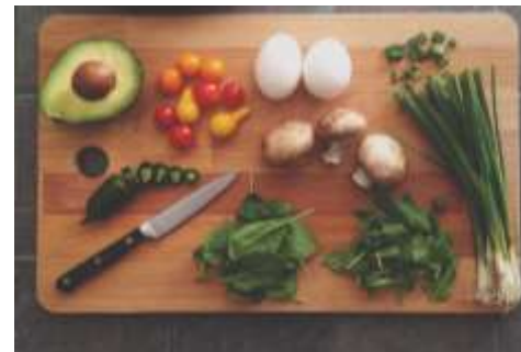
Learn a new recipe