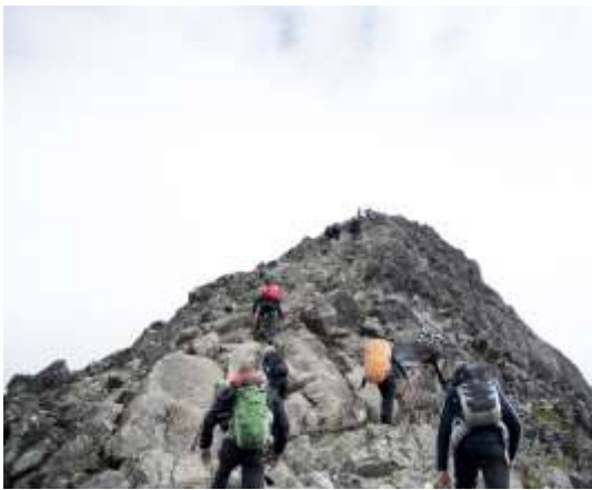
Motivation & ambition