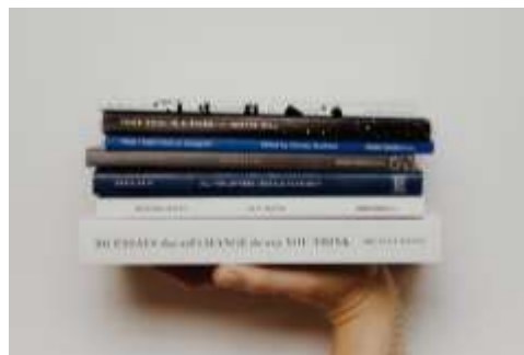
Read a new book