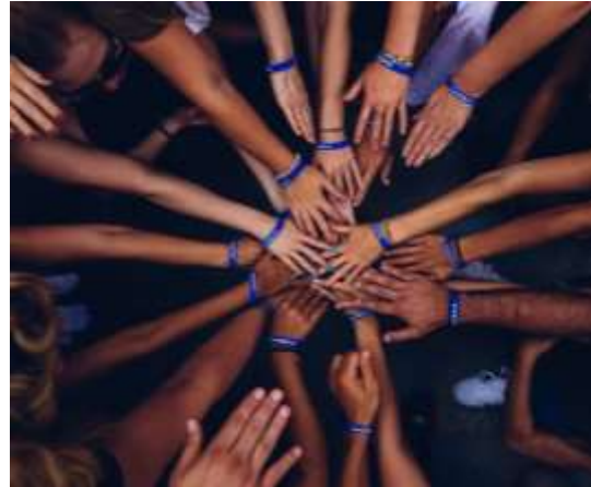
Collaboration & teamwork