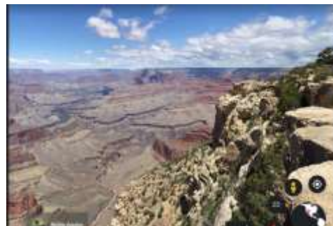
Explore a world wonder