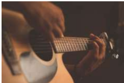
Learn a new song