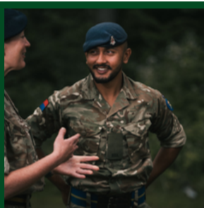
ARMY RECRUITMENT CENTRE

Explore the websites and resources below: