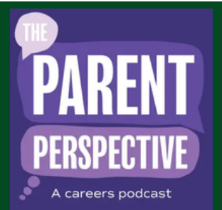
THE PARENT PERSPECTIVE PODCAST

Listen to The Parent Perspective podcast episode dedicated to the Army