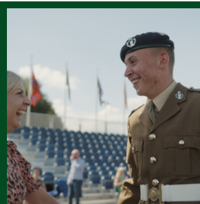
AFC HARROGATE FILM

Watch this short film to learn more about the Army Foundation College in Harrogate