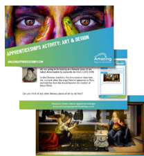
Activity slide deck