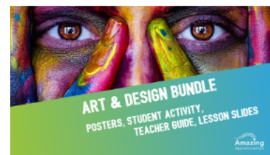
Download the bundle